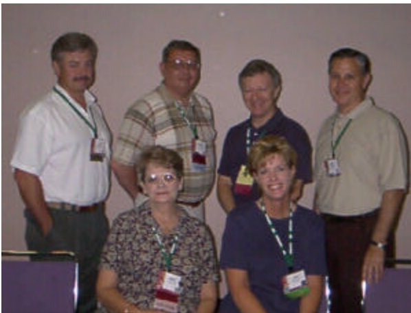
Chapter 41 participants in Mobile Seminar (D Corrigan, Absent)