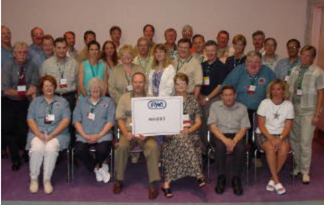
Region 3 Attendees