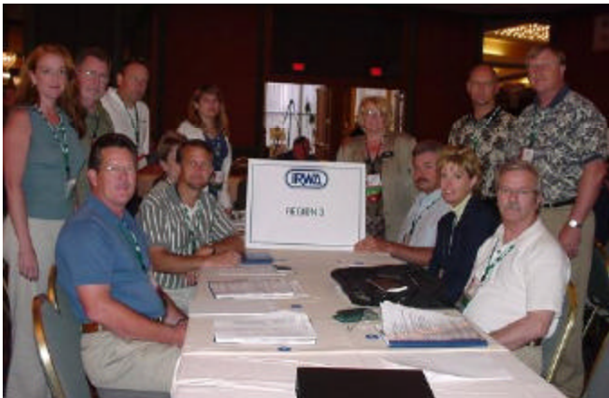
Board of Director's Meeting