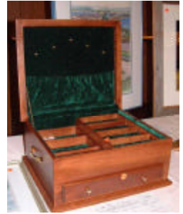
Iowa's Auction Item ($750)