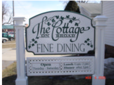
Following our Chapter Meeting we dined at The Cottage on Broad in "uptown" Story City